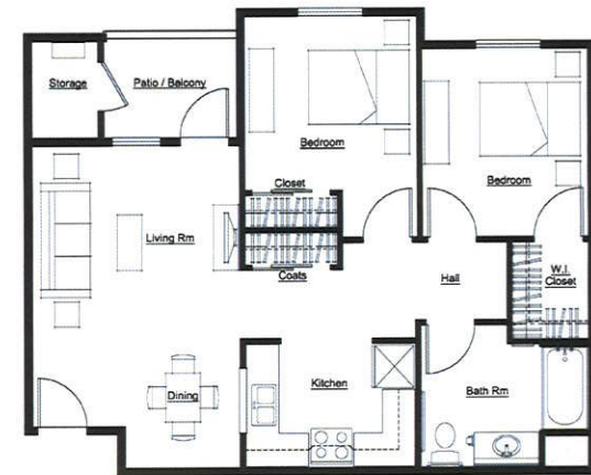
Harmon Pines - Floor Plan 2 2 Bedroom 1 Bath Approx. 923 S.F. Rent $ _____

Prices subject to change at owner's discretion. Income restrictions do apply.